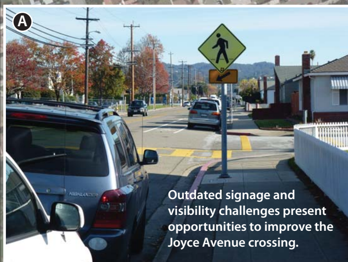
Outdated signage and visibility challenges present opportunities to improve the Joyce Avenue crossing.